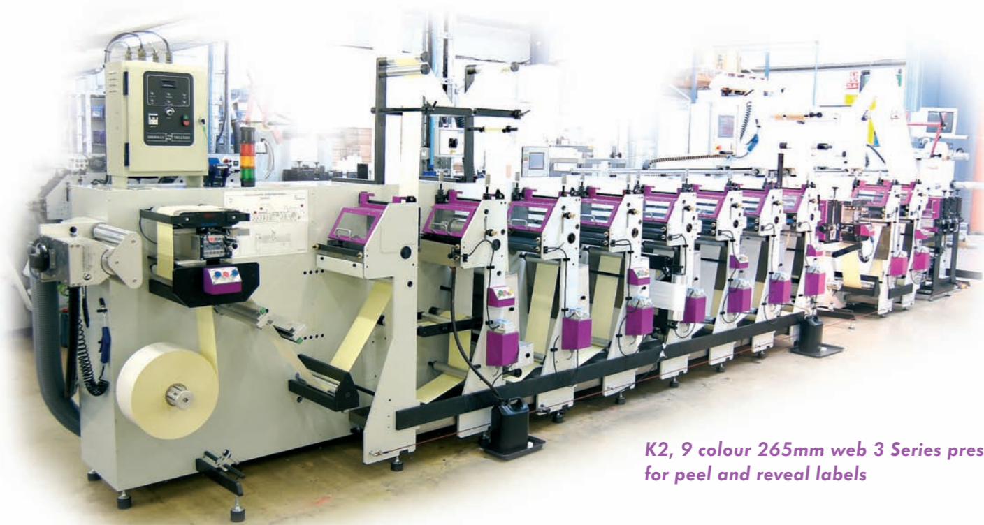
K2, 9 colour 265mm web 3 Series press for peel and reveal labels