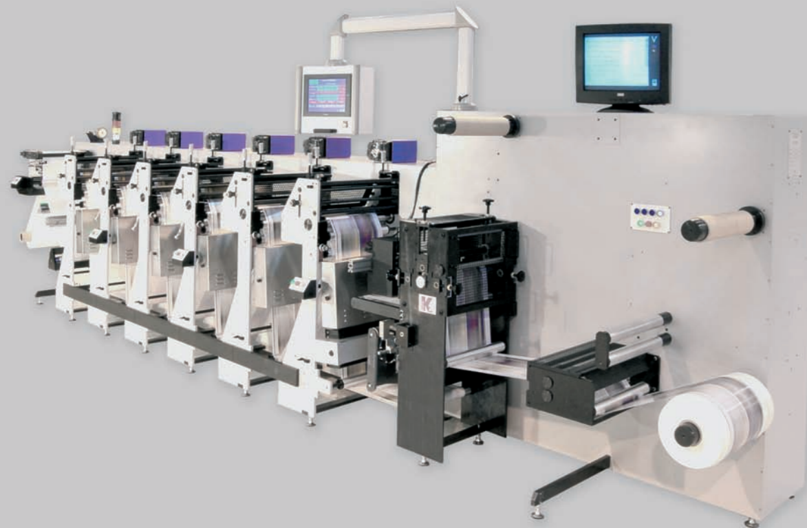
K2, 6 colour 400mm web 3 Series flexo film/label press