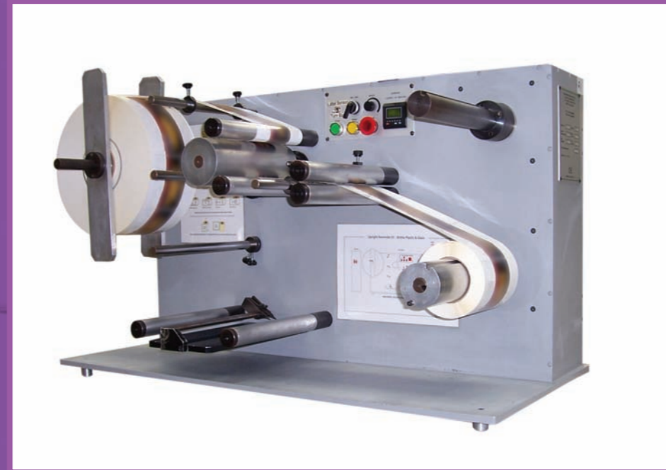
K2 table top slitter/rewinder